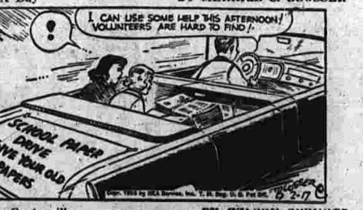
FREAKLES AND HIS FRIENDS