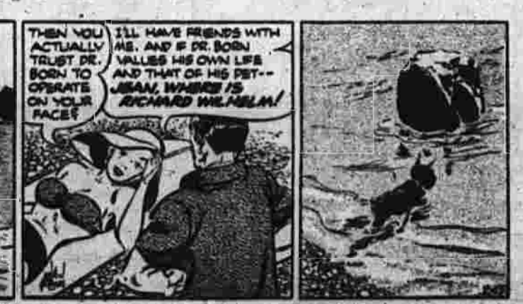
FREAKLES AND HIS FRIENDS BY MERRILL C. BLOSSER