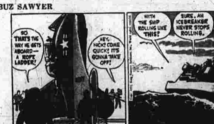
BUZ SAWYER BY ROY CRANE