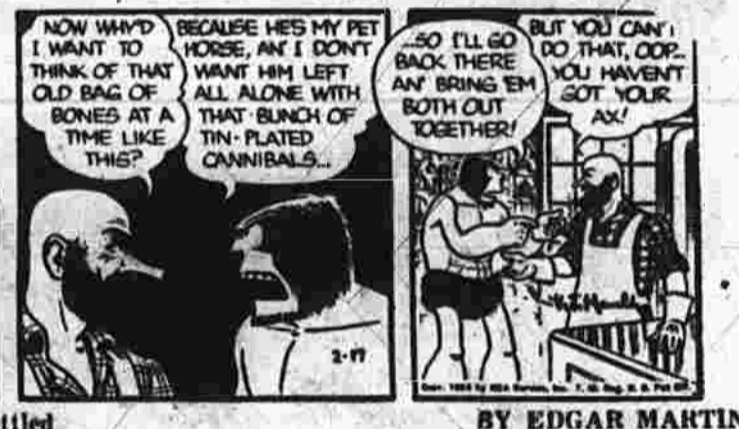
NO WEAPON BY V. T. HAMLIN