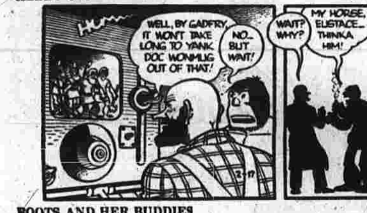
ALLEY OOP BY J. R. WILLIAMS