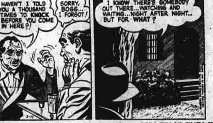
CAPTAIN EASY BY LESLIE TURNER